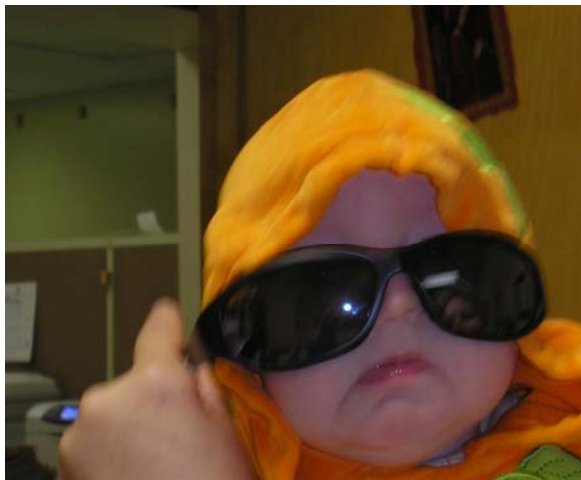
My future is so bright at St. Anthony Catholic School, I gotta wear shades.

NON-PROFIT ORG U.S. POSTAGE PAID Casper, WY 82601 PERMIT 165